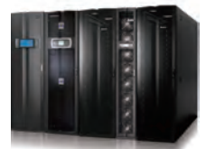
The Modulon DPH is designed in modern IT aesthetics aligned with Delta InfraSuite datacenter solutions.