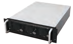
55.6kVA in 3U space

All specifications are subject to change without prior notice.