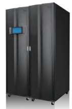
Optional switch cabinet with same IT exterior and dimension